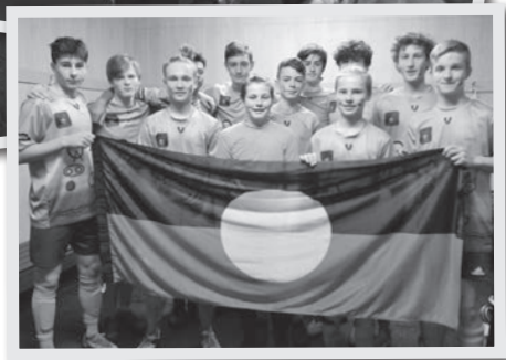
Pictured: Riverside Olympic Football Club Indigenous Round